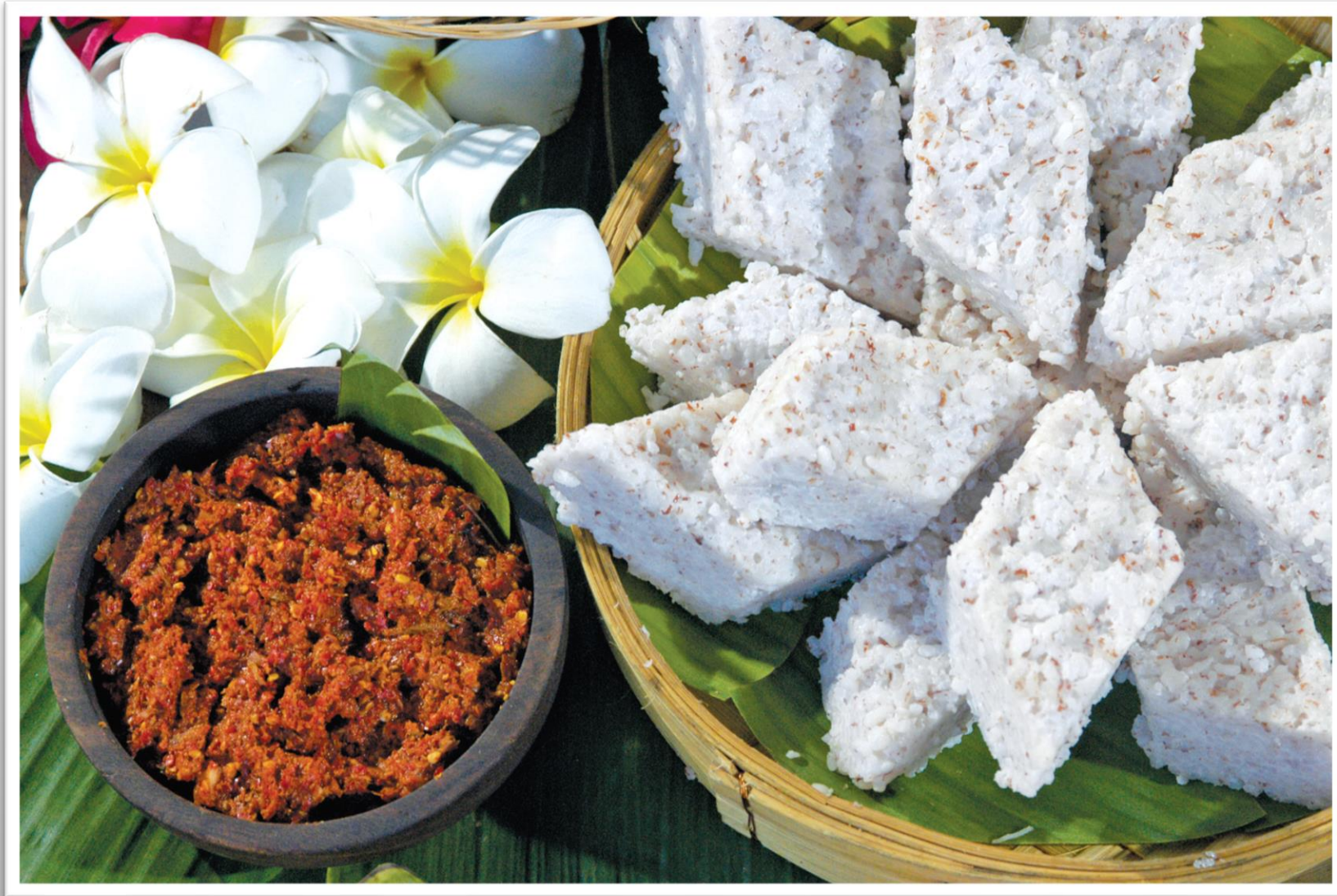
Milk Rice (Kiribath)